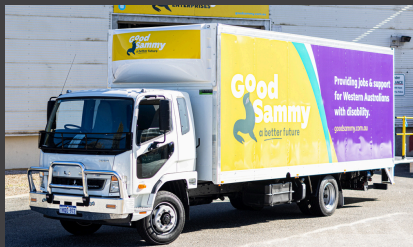
Logistics & Warehousing