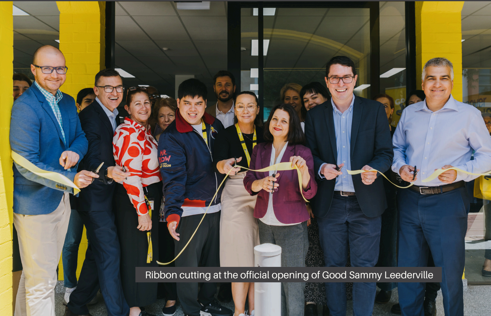
Ribbon cutting at the official opening of Good Sammy Leederville

Creating employment opportunities for people with disability in WA for more than 65 years.