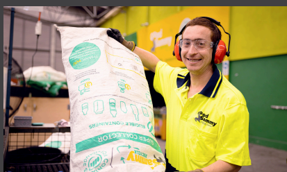
Containers for Change 5 depots + 1000 collection points across WA