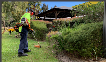
Gardening & Property Care