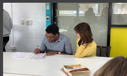
Academy Programs and Certified Traineeships